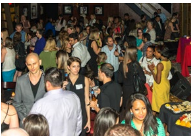
More pictures on facebook!

Following the wildly successful Real Women on the Runway fashion shows, we debuted Real Women on the Reel on June 5. This cocktail party and awareness event included the premiere of our short film about the unique client transformation that happens at Bottomless Closet. The film, by Respect Films!, highlights the stories of our clients as they overcome challenging circumstances to gain confidence and navigate New York's job market. Over 200 people attended the event aimed at raising awareness about Bottomless Closet and the need for our services in the community. A big thank you to our event sponsors including HBO, SKYY Vodka, and Con Edison.